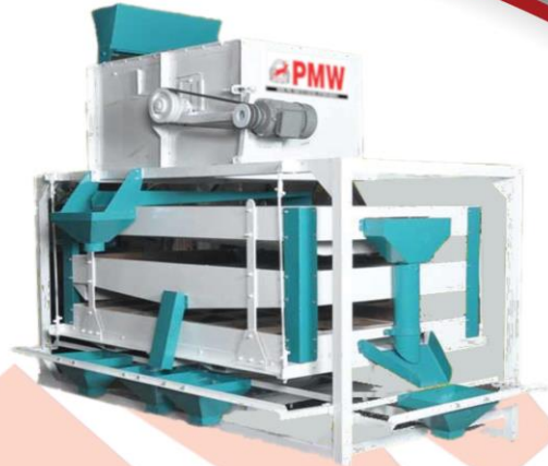
THREE TIER RICE GRADER