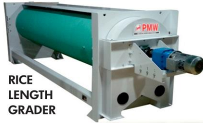
RICE LENGTH GRADER